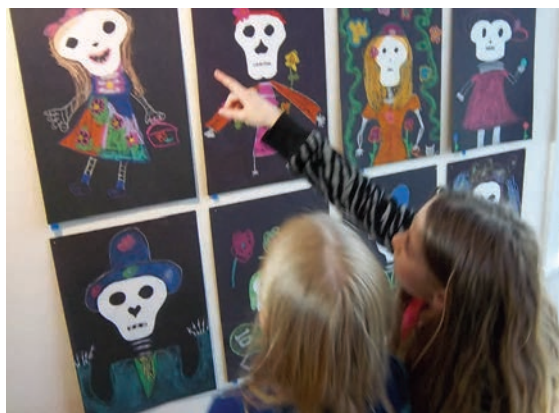
Emerging Artists View Their Work

The Cannon Beach Art Gallery hosted the first Under-18 Regional Youth Art Show in April. The presentation included student artwork from schools stretching from Rockaway Beach to Seaside, Oregon. The show was inspired by the desire to highlight the creative talents of young people along the coast and the importance of art in our communities and schools. This exhibit was such a success that another is planned for April 2012. □