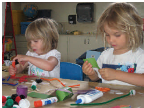
Students included 3-5 year olds